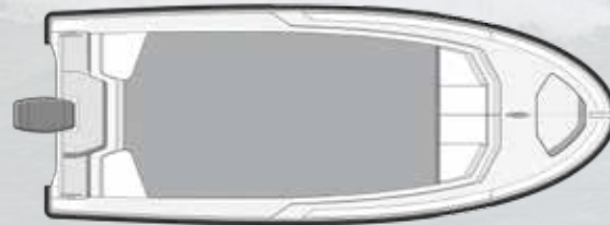
Fastliner 19 plan standard layout