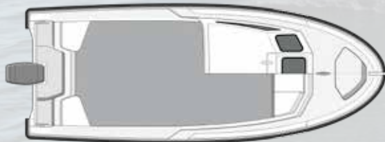
Fastliner 19 plan with optional cuddy